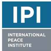
International Peace Institute (IPI), Vienna